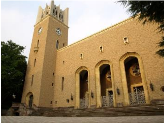
Okuma Auditorium of Waseda University.

The Japan Society for Industrial and Applied Mathematics (JSIAM) and the Mathematical Society of Japan (MSJ) are very happy that our bid for ICIAM 2023 was chosen and would like to express our deep gratitude to those who kindly favored our proposal. We, the two societies, are now preparing the way for the 10th ICIAM Congress to be held in Tokyo, Japan, from August 20–25 in 2023. We understand that we could not have been awarded the honor of hosting the ICIAM congress without the strong support from industry, academia and the Japanese government, in addition to the kind assistance from the Tokyo Convention & Visitors Bureau (TCVB). We plan to attract the largest number (in the history of ICIAM) of mini-symposia of high quality, dedicated to mathematical problems in science, engineering and industry. ICIAM 2023 will showcase the enhanced collaboration between mathematics and industry.