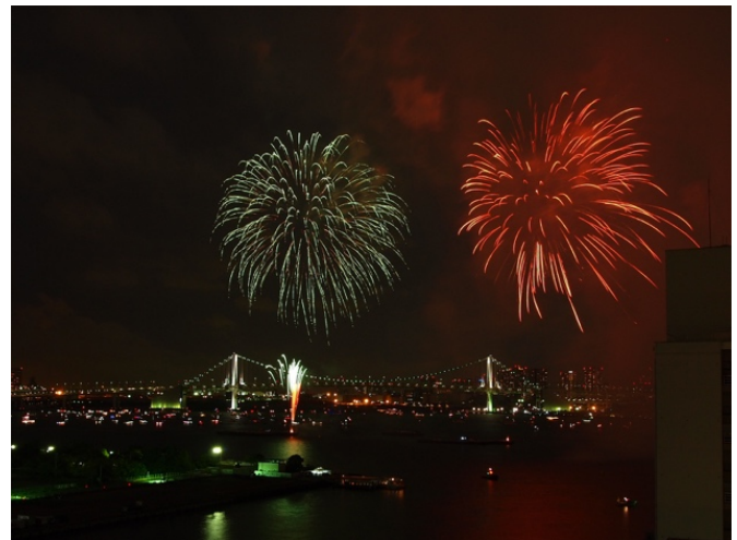
The fireworks in Tokyo. —Image used with permission.

JSIAM and MSJ will deliver a successful and unforgettable 10th ICIAM in Tokyo in 2023. We look forward to welcoming you.