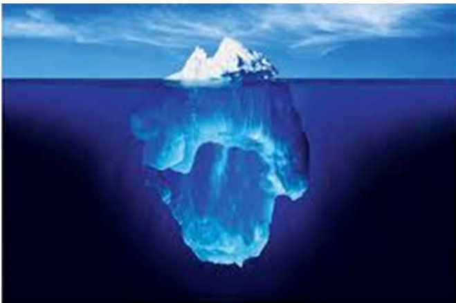
The mathematical iceberg.

The power of mathematics lies in its ability to synthesize, abstract and generalize. This leads to new widely applicable mathematical concepts, where the wide areas of application can be completely out of sight of the original particular application field or the original practical challenge where the ideas may have originated. The synthesis, abstraction and generalization can only be obtained through development within mathematics itself. Only through such inner mathematical development can the ideas from one sort of challenge develop into a mature theory that can efficiently transfer models and methods for transferring solutions from one sector of application to another, very different, application. Without supporting such inner mathematical life, the individually developed ideas will only very slowly generalize and mature, and very similar paths will have to be struggled through inefficiently within each individual challenge sector. Mathematics can be seen as a soil in which other sciences, technology and applications are deeply rooted. Its role is principally different from the role of other disciplines that it serves.