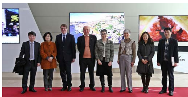
The site-visit committee, local hosts and representatives from the Seoul Convention Center at the tour of LG Display